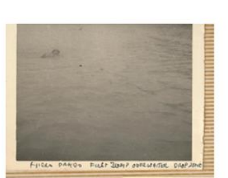
DAY AND NIGHT EARTH AND WATER DZ AN LZ