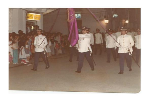
THURSDAY HOLY WEEK

Our Operational Unit was permanently integrated with the civil, Police and DAS authorities, working harmoniously at the service of the community.